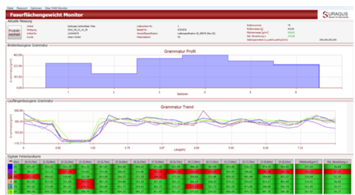
Fiber Areal Weight monitoring of 6 lanes. Roll report listing locations with ok and not-ok material.